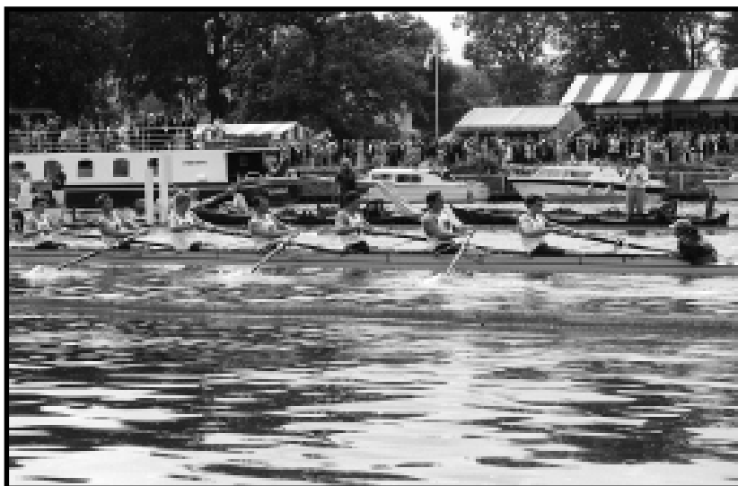
The Husky junior varsity competed in the Temple Challenge Cup at Henley in 1997.