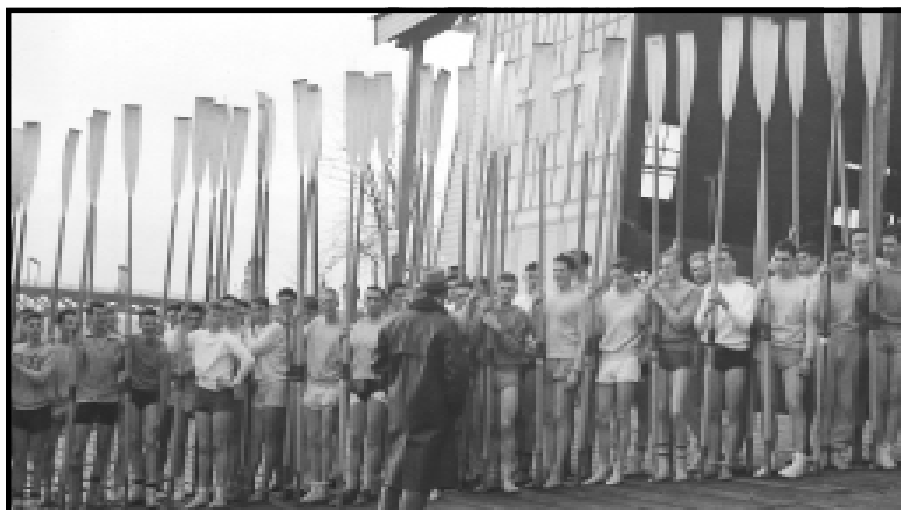
Rowing is a tradition-rich sport at the University of Washington. Husky crews have won Olympic gold, national collegiate championships and rowed overseas on numerous occasions.

The Husky women competed in their first national championship regatta in 1970 on