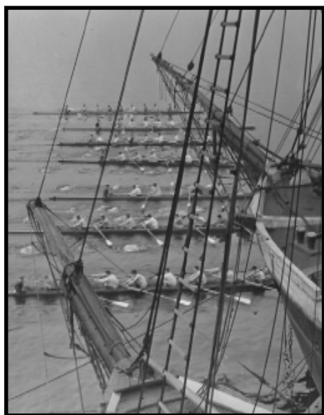
Washington crew is an important part in Seattle's rich maritime history.