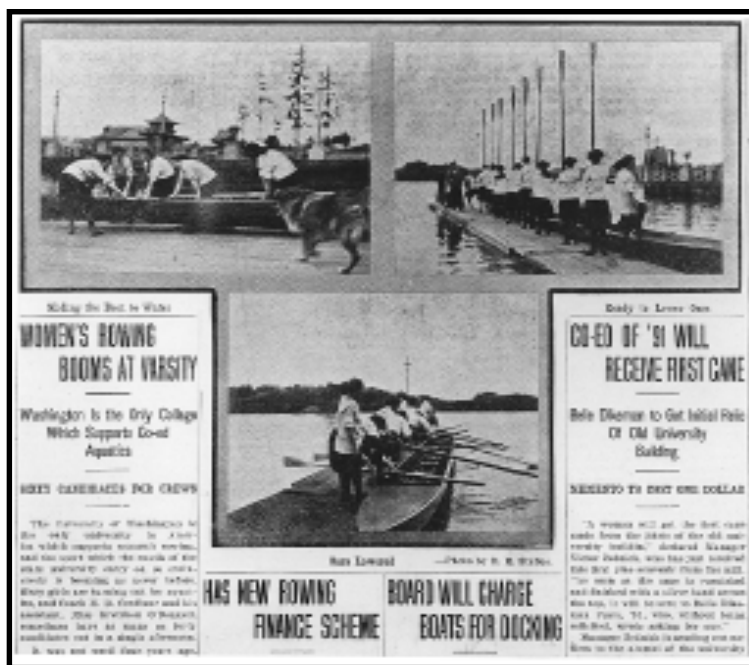
Women's rowing flourished at Washington early in the 20th century.

Taking over the helm upon Leader's departure was Russell S. (Rusty) Callow. Washington Rowing flourished during Callow's tenure (1922-