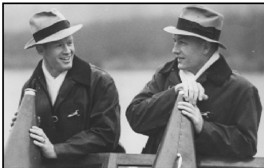
Husky Hall of Famer Al Ulbrickson (right) coached three Olympic medal winning crews.

Ulbrickson's 1958 crew had a new challenge. They needed to go undefeated during the racing season to qualify for the prestigious